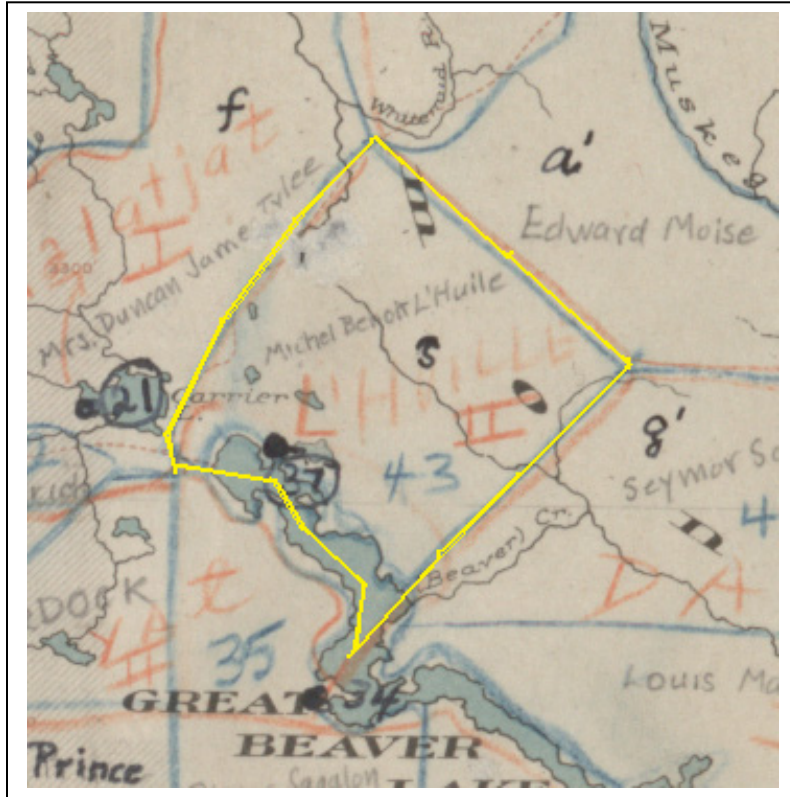
The Maiyoo Keyoh as defined in a map drawn by Julian Steward in 1940.

Maiyoo Keyoh agrees to work towards the spirit and intent of this Protocol with the full knowledge and understanding that it is a good faith Protocol and does not carry any legally binding obligations to any Party, and that this Protocol does not alter, abridge or modify any of the Parties' individual authorities or responsibilities.